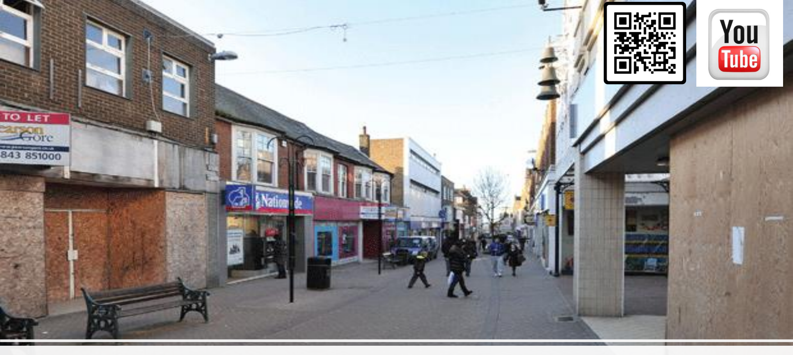
Why do so many businesses fail?