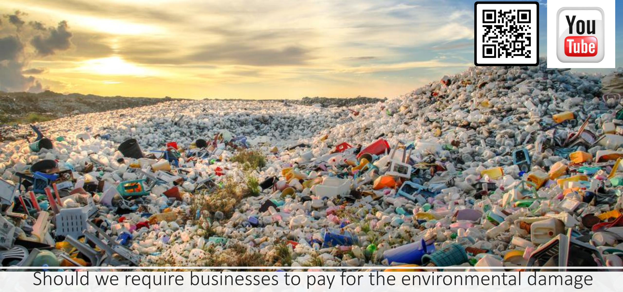
Should we require businesses to pay for the environmental damage they cause?